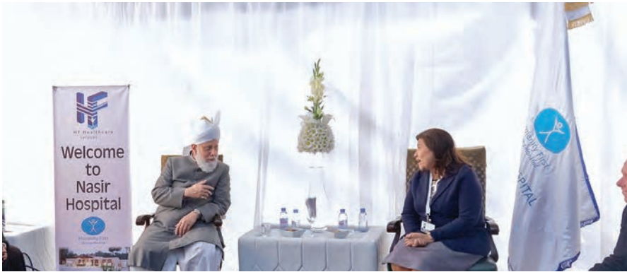
Hazrat Mirza Masroor Ahmad, Khalifatul-Masih V aba Meets with U.S. Congresswoman Norma Torres