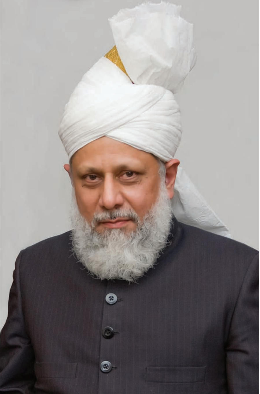
Hazrat Mirza Masroor Ahmad Khalifatul-Masih V aba