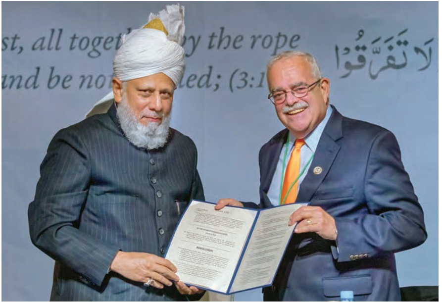
Hazrat Mirza Masroor Ahmad, Khalifatul-Masih V aba Receives a Special Bi-Partisan Resolution from U.S. Congress for His U.S. Tour Presented by U.S. Congressman Gerry Connolly