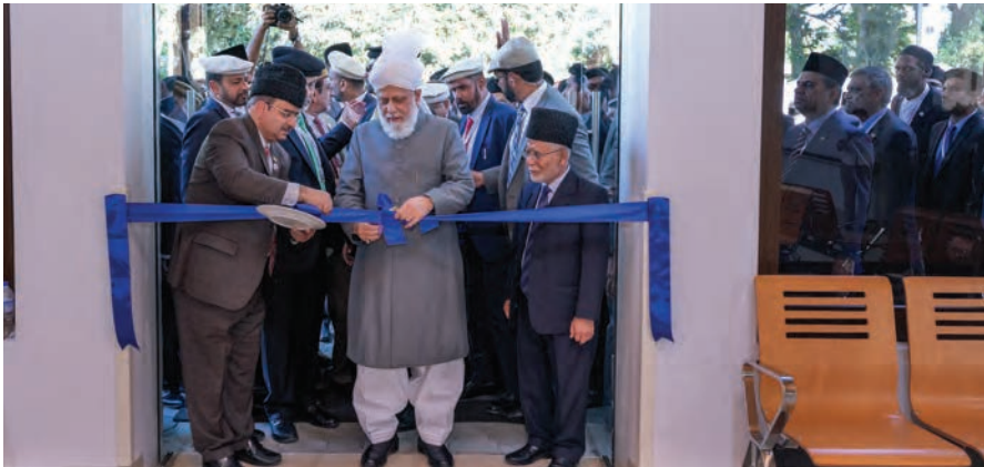
Hazrat Mirza Masroor Ahmad, Khalifatul-Masih V aba Cuts Ribbon Inaugurating Nasir Hospital