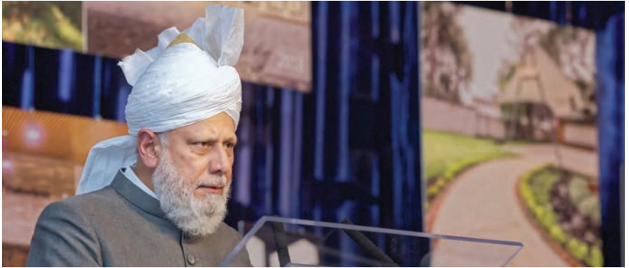
Hazrat Mirza Masroor Ahmad, Khalifatul-Masih V aba , Addresses the Guest Reception at Nasir Hospital's Inauguration