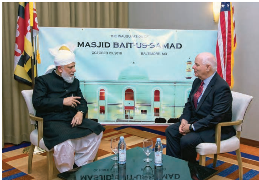
Hazrat Mirza Masroor Ahmad, Khalifatul-Masih V aba Meets with Honourable Ben Cardin, U.S. Senator