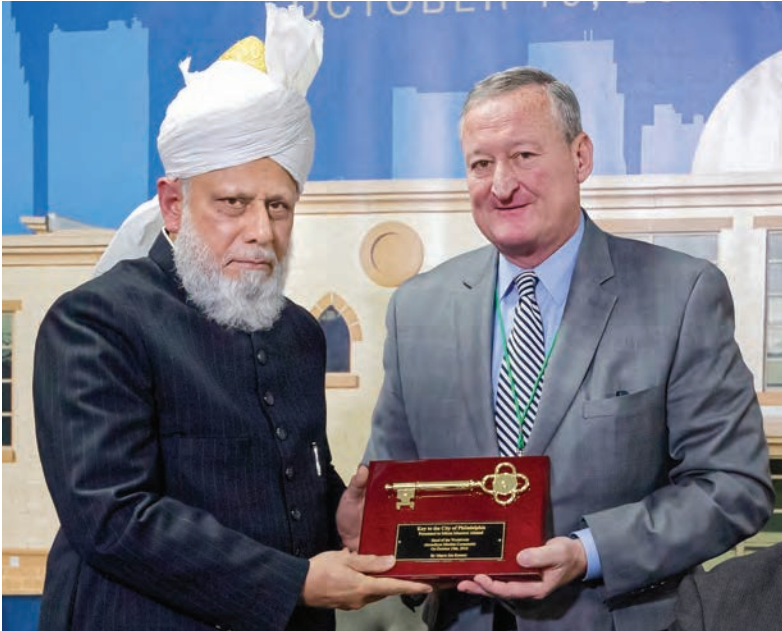
Hazrat Mirza Masroor Ahmad, Khalifatul-Masih V*ba Receives the Key to the City of Philadelphia from Honourable James Kenney, Mayor of Philadelphia