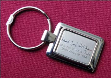
Above: Keychain given to participants of the Ijtima to encourage registration. Rest of the page: Participants listening to proceedings attentively.