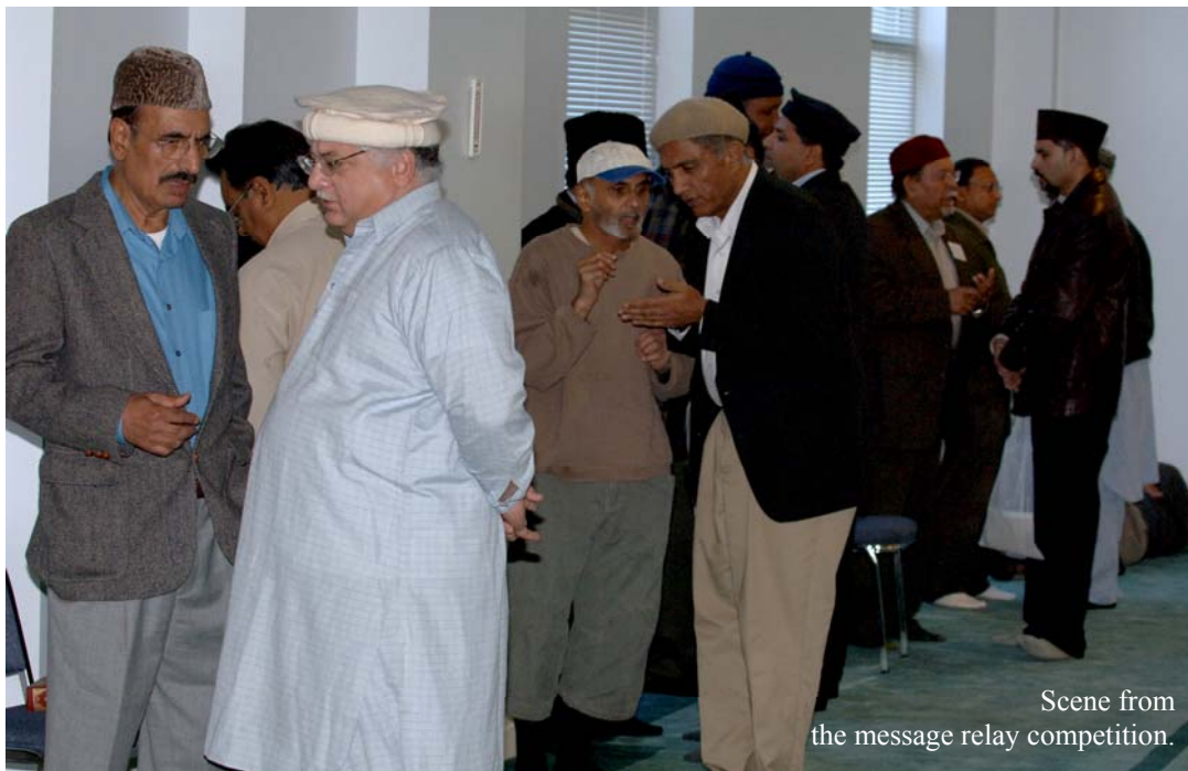
Scene from the message relay competition.

Total attendance at the 25th Annual Ijtima was around 317 members from all parts of the US.