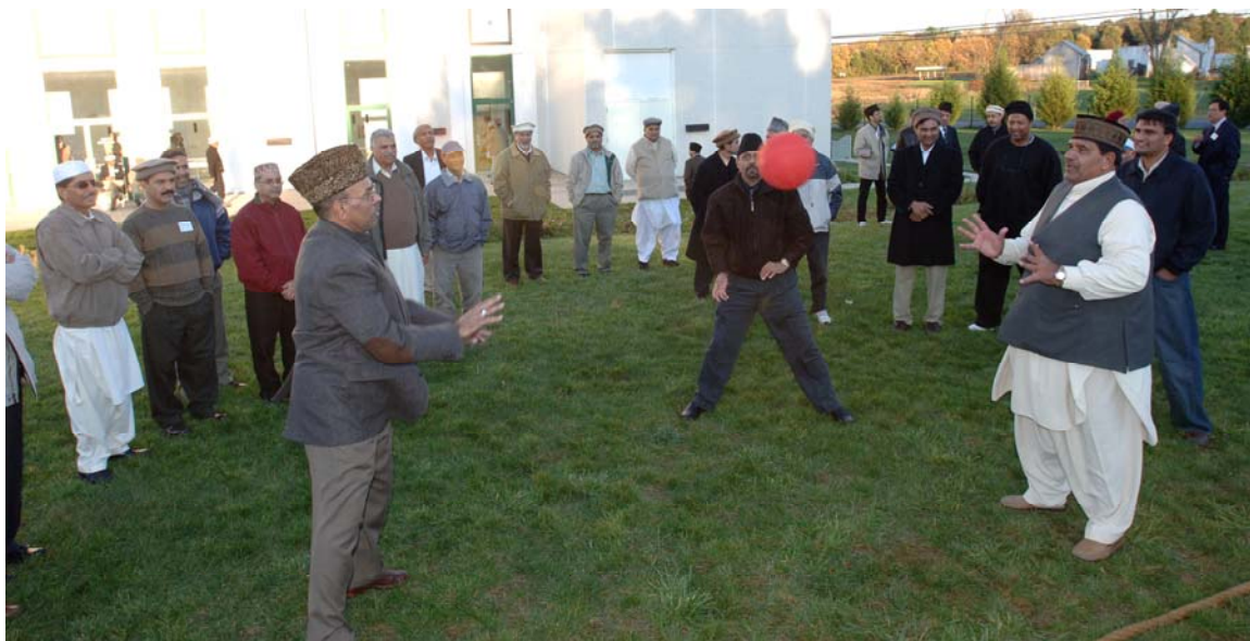
Musical ball replaces the traditional musical chairs (above). Scenes from the fierce arm-wrestling competition (right and below..