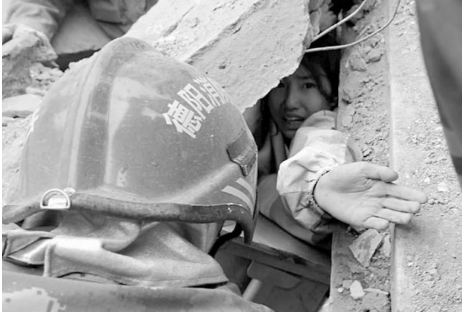
Rescuers try to help a stranded student out of the debris of a primary school in Mianzhu.

Because the earthquake struck in the middle of the day, more than 900 parents lost their only child, in collapsed school buildings. The tremor was felt as far away as Beijing and the Thai capital Bangkok.