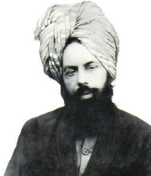
His holiness Mirza Ghulam Ahmad (1835-1908) Founder of the Ahmadiyya Muslim Community The Promised Messiah & Imam Mahdi

“In the sacred city of Qadian an Indian Prophet was born who saturated his