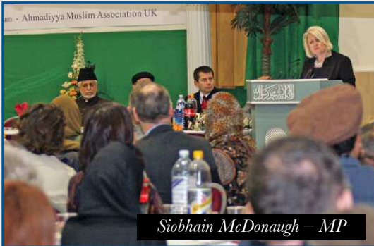
Siobhain McDonagh – MP