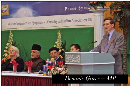
Dominic Grieve – MP

The MP for Mitcham and Morden, Siobhain McDonagh spoke of the misrepresentation of Islam. She said that it is extraordinary that anyone who knows anything about Islam can associate this faith with the actions of violent Islamic extremists. It is a terrible injustice to Islam as it is a peaceful religion. She mentioned that Islam is a religion based on tolerance and respect and it is a religion that encourages all people to practise their own faiths without hindrance and without threat.