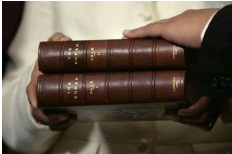
MR KEITH EILLISON TAKING OATH

United States Congressman Mr. Keith Ellison, a Democrat from Minnesota places his hand on an English translation of the Koran published in the 1750s and once owned by Thomas Jefferson as he is sworn in as the first Muslim member of Congress on Capital Hill.