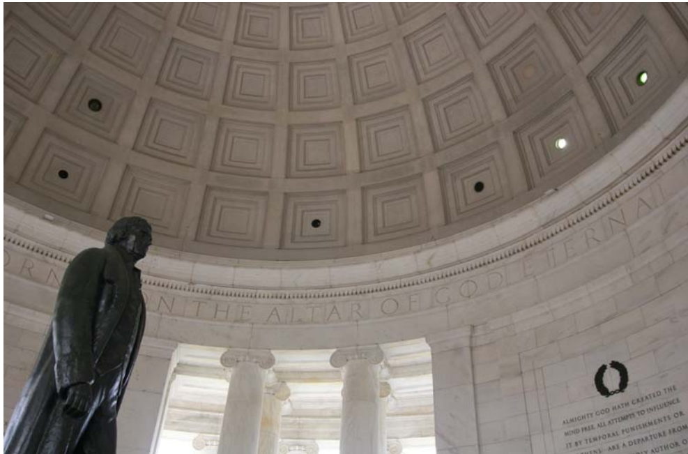
INSIDE THE MEMORIAL DEPICTING HIS QUOTE, 'GOD ETERNAL'

Jefferson wrote at length on religion and most scholars agree with the claim that Jefferson was a deist, a common position held by intellectuals in the late 18th century. 36 He believed in One God and was a Unitarian. Historically Unitarianism believed in the oneness of God and not the Christian doctrine of the Trinity (Father, Son, and Holy Spirit in one God) proclaimed at the Council of Nicaea in 325 AD. Historic Unitarians believed in the moral authority, but not the deity, of Jesus. Throughout the world, many Unitarian congregations and associations belong to the International Council of Unitarians and Universalists. In the United States and Canada many Unitarians are Unitarian Universalist or UU, reflecting an institutional consolidation between Unitarianism and Universalism. Today, most Unitarian Universalists do not consider themselves Christians, even if they share some beliefs quite similar to those of mainstream Christians. 37 There is a small percentage of Unitarian Universalists who have a Christian-centric belief system.