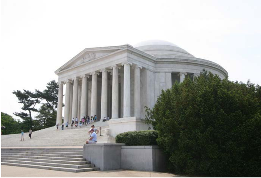
THOMAS JEFFERSON MEMORIAL IN WASHINGTON DC

Jefferson embraced Priestly views whole heartedly. The description of President Thomas Jefferson in Wikipedia.com is very revealing: