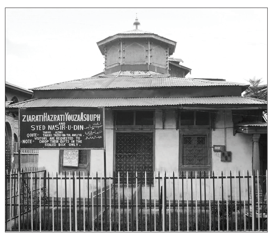
The Tomb of Jesus— Khanyar Street, Srinagar, Kashmir