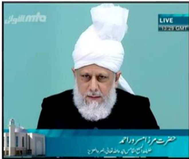
Sermon Delivered by Hadhrat Mirza Masroor Ahmad (aba); Head of the Ahmadiyya Muslim Community