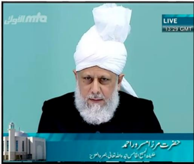
Sermon Delivered by Hadhrat Mirza Masroor Ahmad (aba); Head of the Ahmadiyya Muslim Community