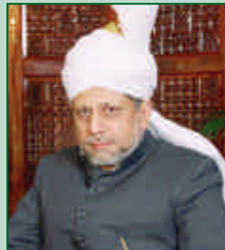
Hadhrat Mirza Masroor Ahmad Head of the worldwide Ahmadiyya Community

Islam into the 21 st century on a truly global scale through numerous Community projects and the creation of a unique satellite tv channel. His passing away in April 2003 was marked by condolences from some of the world's leading public figures. Even his funeral procession and arrangements were assisted by the authorities and full honours with official protocol was observed as a mark of respect for a highly respected leader.