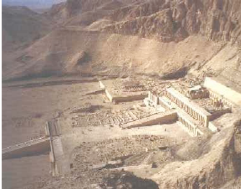
Valley of the Kings-Tomb of Ramesses II and his sons