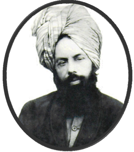
His holiness Mirza Ghulam Ahmad (1835-1908) Founder of the Ahmadiyya Muslim Community The Promised Messiah & Imam Mahdi