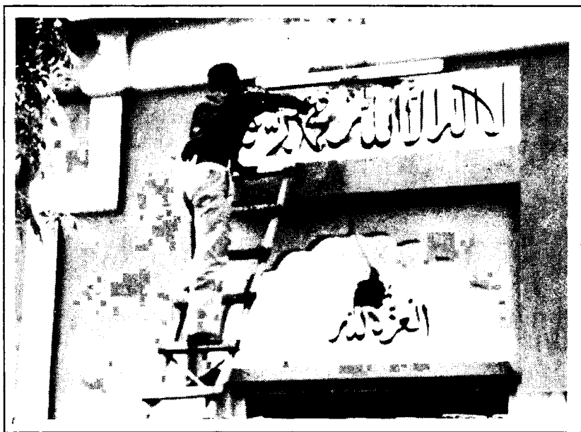
A PAKISTANI POLICE CONSTABLE ERASING THE NAME OF HADHRAT MUHAMMAD* FROM THE KALIMAH ON THE FASCIA OF THE AHMADIYYA MOSQUE AT SIR SHAMSHEER ROAD, FAISALABAD IN PAKISTAN

Kalimah and substituted Ahmad for Muhammad, then they would not have the Kalimah with Muhammad written on their mosques throughout the world. Nor would the Pakistan Government have to employ its police to erase the Kalimah with Muhammad an integral part of it from the fascia of numerous Ahmadiyya Muslim mosques in Pakistan in the wake of Ordinance XX of 1984 after Ahmadi Muslims had refused to erase it with their own hands. An evidence of one such desecration of the Islamic Kalimah by the Pakistan Police under instructions of Zia ul Haq's junta is presented below.