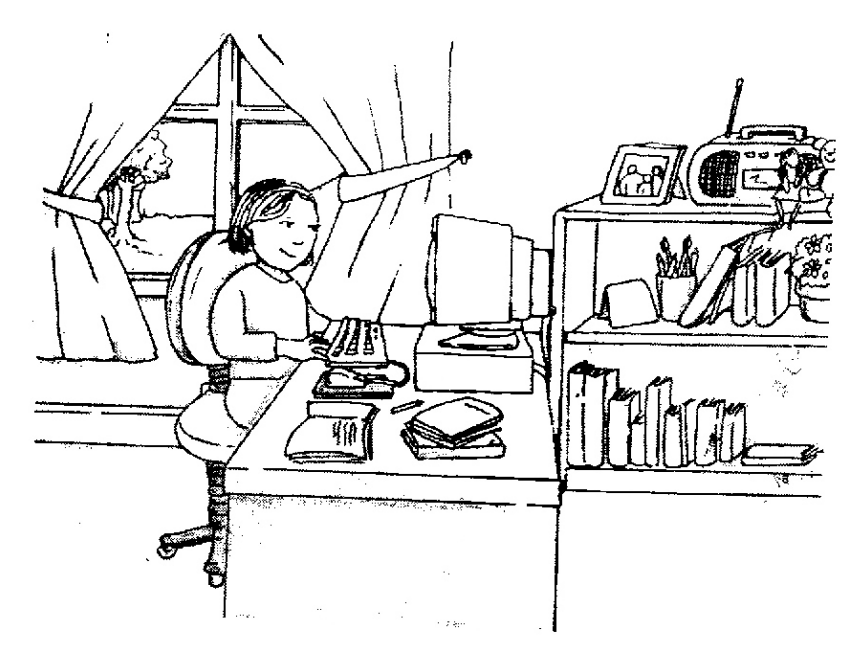
Illustration Girls should receive a good education