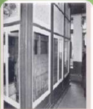
THE TOMB OF JESUS Khanqar Street, Srinagar, Kashmir

The fact of the matter is that Jesus died at the age of 120 years at Srinagar, Kashmir, where his tomb is still to be found in the Khan Yar quarter