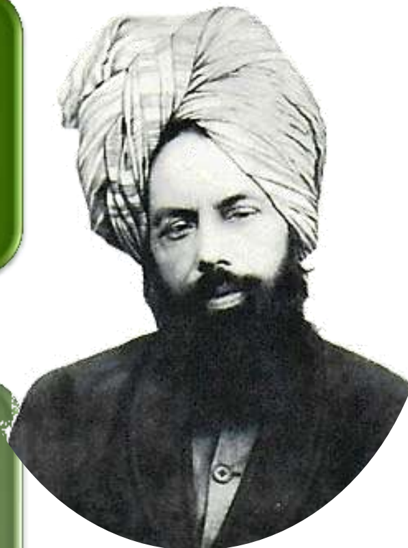
Jesus in India

The main thesis expounded in this treatise is Jesus' deliverance from death on the Cross and his subsequent journey to India in quest of the lost tribes of Israel whom he had to gather into his fold as foretold by Jesus himself