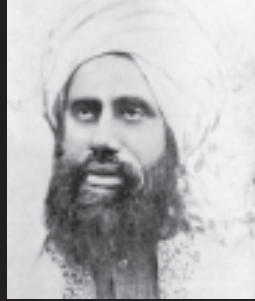
Hadhrat Maulana Nur-ud-Din, Khalifatul Masih I

The commonly used English words 'Caliph' and 'Caliphate' are both taken and transformed from the Arabic terms 'khalifa' and 'khilafat'. The term 'caliph' is in English use since 1393, and 'caliphate' since 1614. One of the reasons for the richness of English vocabulary is its ability to borrow and absorb foreign words and phrases in abundance. English speaking people use words taken from almost every other language in the world. For example, from Indo-Pakistani languages such as Urdu, Hindi and Sanskrit, English has obtained 'camphor', 'ginger', 'musk', 'sugar', 'punch', 'guru', 'nirvana', 'bungalow', 'jungle', 'cheetah', 'thug', 'pundit' and 'Aryan'. From Farsi are 'bazaar', 'caravan', 'dervish', 'jasmine', 'magazine', 'rook' and 'checkmate'. From Hebrew are the words 'Amen', 'jubilee', 'kosher', 'Satan' and 'messiah'. Similarly, numerous names, phrases and terms are taken from Arabic language. To mention only a few: Admiral (Amir-ul-bahr, or amir-ar-rah), alchemy (al-kimiya), alcohol (al-kohl), algebra (al-gebro-wal-maqabilah), algorithm (al-Khowarazmi), arsenal (dar-as-sina'ah), assassin (hashishin), coffee (qawah), El Cid (al-Sayyid), elixir (al-iksir), emir (Amir), fakir (faqir), genie (jinn), minaret (minarah), Ottoman (Uthman), Saracen (sharqiyien), sherbet & syrup (sharbah, sharaab), sofa (suffah), talisman ( talism), and zero (sifr).