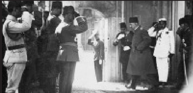
The last 'Caliph,' Abdul Majid II, was deposed by the Turkish National Assembly. In the days that followed, the Assembly transferred the power of the Ottoman Caliphate into itself.

Hadhrat Maulana Nur-ud-Din, Khalifatul Masih I, (may Allah be pleased with him) was elected Khalifah in 1908, before the demise of the Ottoman Caliphate.